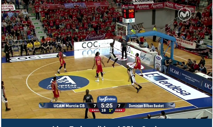
Liga Endesa (Liga ACB) - Spain